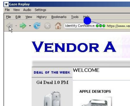
Fig. 3. A screenshot of the eye tracker replay function. The large circle near the identity confidence indicator shows the participant's fixation on that region of the screen.

One of the more interesting findings in the eye tracking data was how long users spent gazing at the content of the web pages as opposed to gazing at the browser chrome. On average, the 15 participants who gazed at traditional indicators, new identity indicators, or both, spent about 8.75% of time gazing at any part of the browser chrome. The remaining 13 participants who did not gaze at indicators spent only 3.5% of their time focusing on browser chrome as opposed to content. These percentages may have been even lower had the tasks involved in the study taken longer to complete. While other studies have found that many users are unable to distinguish between web page content and chrome, ours suggests they do distinguish between the two and that they rarely glance at the chrome at all. This finding was also supported by the participants' comments during the follow-up interview. When the identity indicators were pointed out to participants, many made comments such as "I didn't even think to look up there" or "I was only focusing on the web page itself."